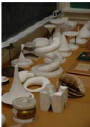
Models on display in 317 Altgeld Hall.

Besides making the models more available to the public, another key purpose of the upcoming website is to make a photographic time capsule of the model collection to preserve it for the future. The collection,